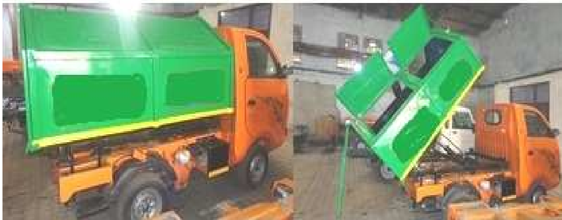
Proposed Vehicle Picture